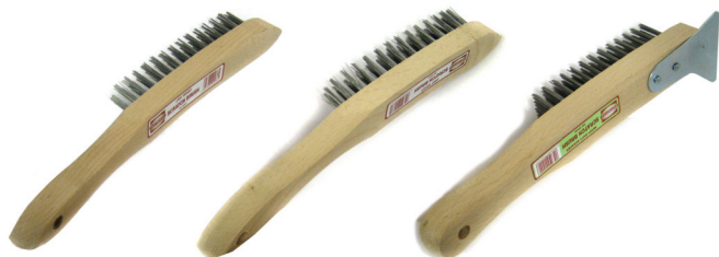
Three Row Four Row Four Row with Scraper